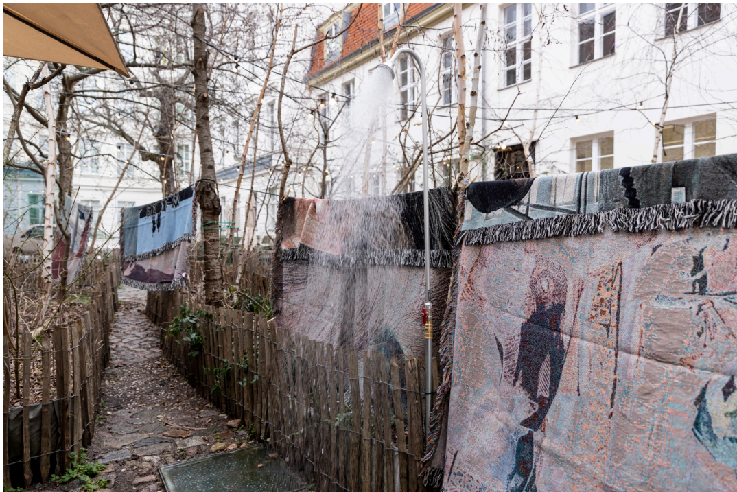
Mercedes-Benz sauna by BLESS in collaboration with Sam Chermayeff Office at KW.