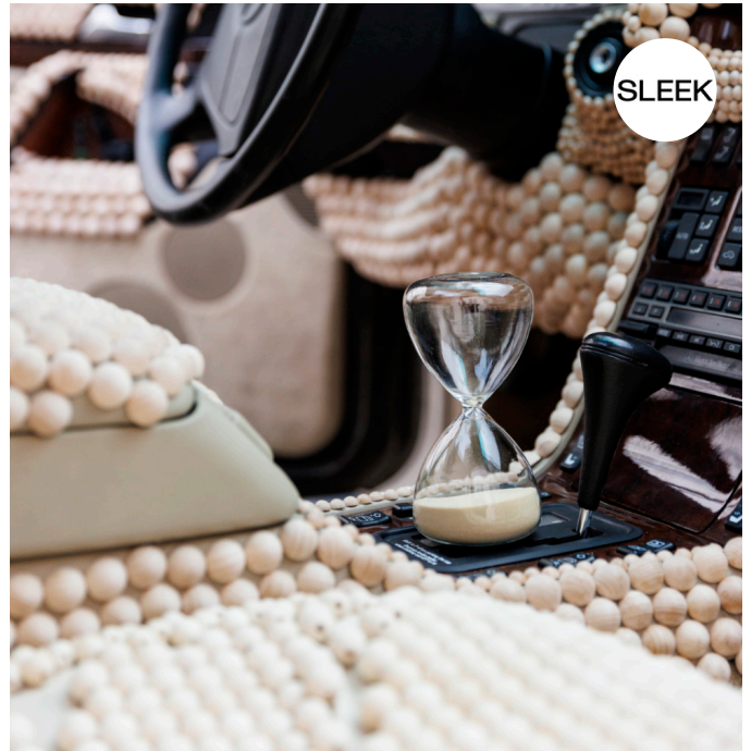
Mercedes-Benz sauna by BLESS in collaboration with Sam Chermayeff Office at KW.