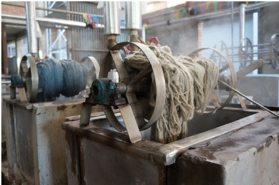
Reuber Henning x Bless: between illusion and reality