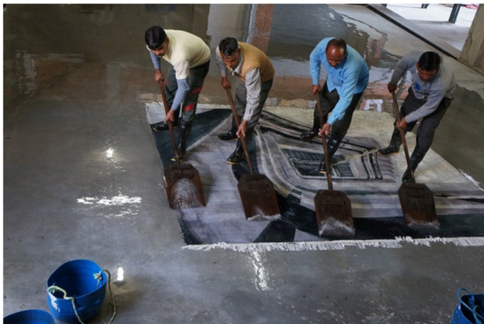
Reuber Henning x Bless: between illusion and reality